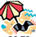
GO TO THE BEACH