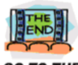
GO TO THE MOVIES