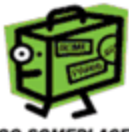
GO SOMEPLACE YOU'VE NEVER BEEN TO BEFORE