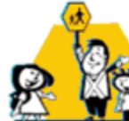
TAKE A WALK