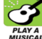
PLAY A MUSICAL INSTRUMENT