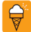
EAT ICE CREAM