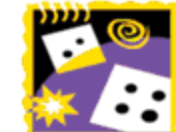
PLAY BOARD GAMES