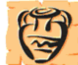
TAKE A POTTERY CLASS