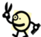
GO TO THE HAIRDRESSER