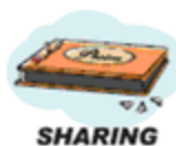
SHARING PICTURES OF THE FAMILY