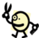
GO TO THE HAIRDRESSER