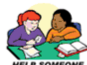
HELP SOMEONE IN YOUR NEIGHBORHOOD