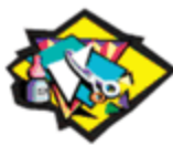
CREATE A SCRAPBOOK