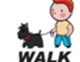
WALK THE DOG