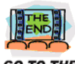
GO TO THE MOVIES