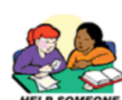
HELP SOMEONE IN YOUR NEIGHBORHOOD