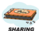
SHARING PICTURES OF THE FAMILY