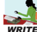
WRITE A BOOK