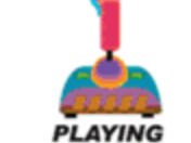
PLAYING VIDEO GAMES