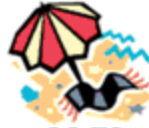
GO TO THE BEACH