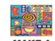
MAKE A COLLAGE