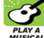
PLAY A MUSICAL INSTRUMENT