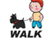
WALK THE DOG