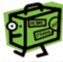
GO SOMEPLACE YOU'VE NEVER BEEN TO BEFORE