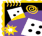
PLAY BOARD GAMES