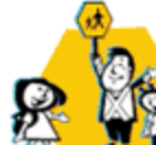
TAKE A WALK