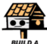
BUILD A BIRD HOUSE