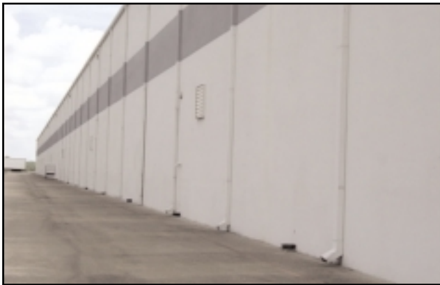
Outside of a Warehouse