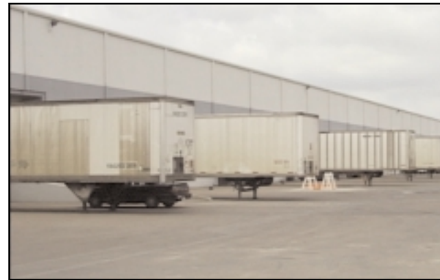
Warehouse Truck Dock